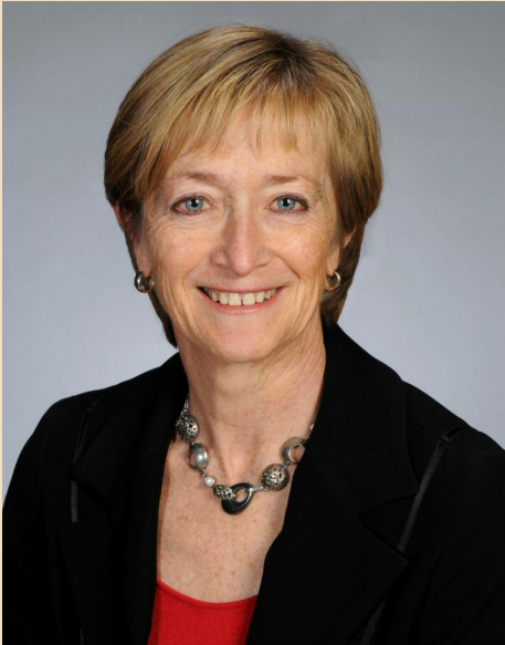
The Hon. Marie Deschamps