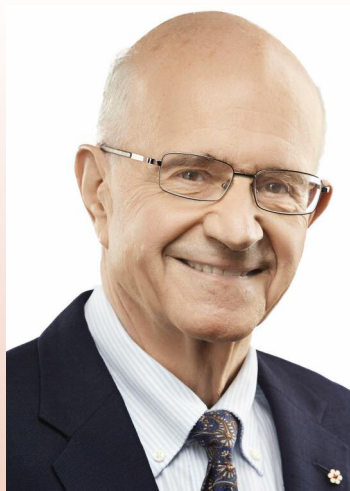
The Hon. Frank Iacobucci

Visiting Bullock Chair the Honourable Frank Iacobucci reflects on his visit to Israel